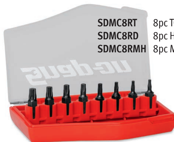
SDMC8RT 8pc TORX® Screwdriver Bit Set SDMC8RD 8pc Hex Screwdriver Bit Set SDMC8RMH 8pc Metric Hex Screwdriver Bit Set