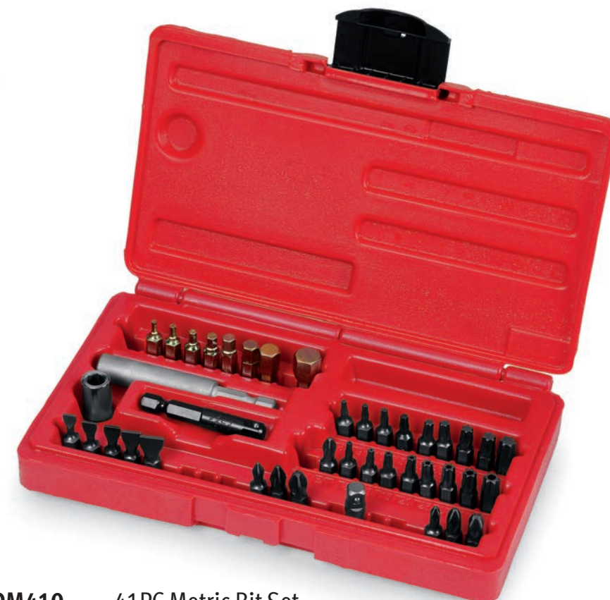
SDM410 41PC Metric Bit Set SDM400A Master SAE Screwdriver Bit Set